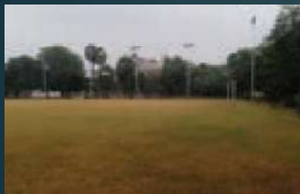
Football & Hockey, Near Dept of Biotechnology