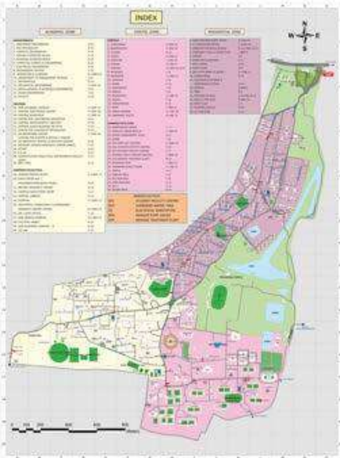
LAYOUT OF BUILDINGS - INDIAN INSTITUTE OF TECHNOLOGY MADRAS AS ON 07-07-2021