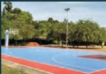
Basketball Court, 2 nos of Concrete court near Volleyball Court.