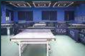
Badminton, 5 Nos (Indoor multigame Sports facility in Ground floor)