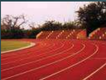
Manohar C Watsa Stadium, we have 400 meters synthetic Track Opposite to Director's Bungalow. The Stadium remains closed between 10 am and 4 pm.