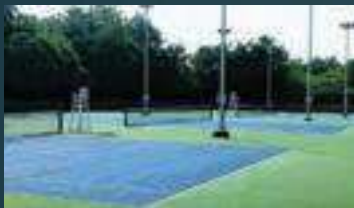
Tennis Court, a Court near Basketball Court.