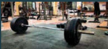
Sports Complex. (Opp. To Taramani Guest House) Ground Floor: Weightlifting, Table Tennis 1st floor: Fitness Centre 2nd Floor: 2 nos. of Wooden Squash Courts